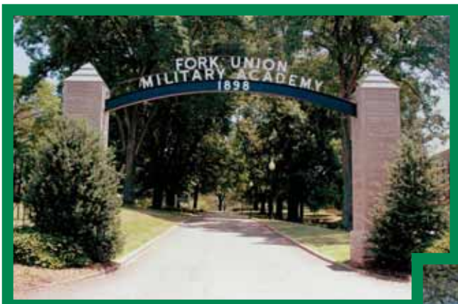
The main entrance to campus is located on US Route 15.