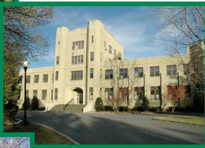
Hatcher Hall, built in 1916, is where you'll find our Admissions Office and other administration and business offices.