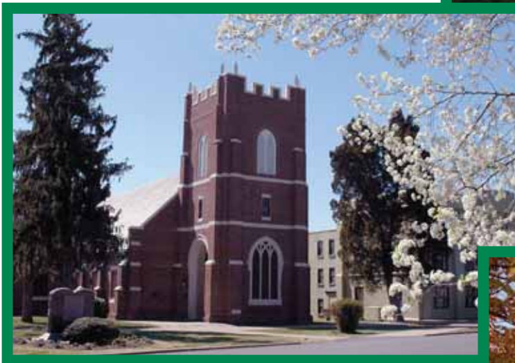
Wicker Chapel is at the heart of the campus.