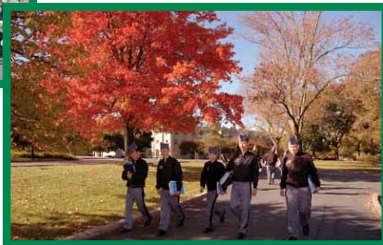
Cadets head for class around the Middle School Circle.